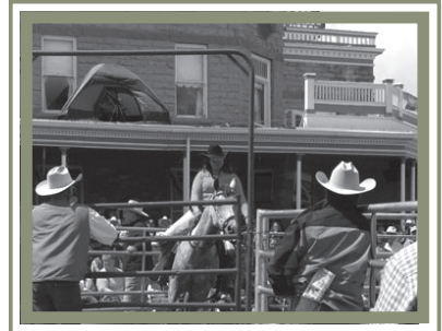
Enjoy the Top Notch Horse Sale in May in front of the Irma

Ham at the Carving • Bacon • Pork Sausage • Buffalo Sausage Irma Fries • Cereal • French Toast • Hot Cakes • Rolls Green Chili • Tortillas • Scrambled Eggs • Fresh Fruit Biscuits & Gravy • Corned Beef Hash Irma's Famous Bread Pudding w/ Whiskey Sauce